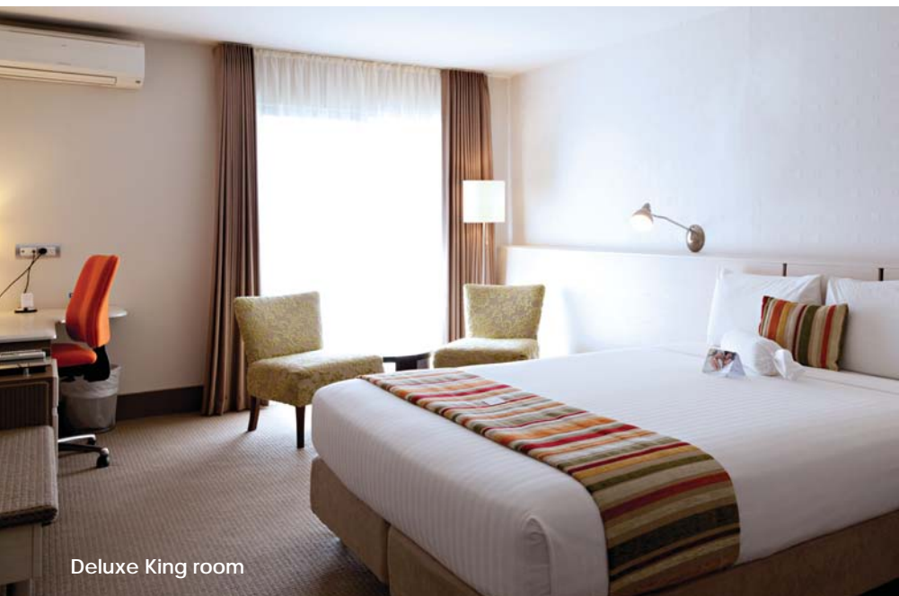
Deluxe King room