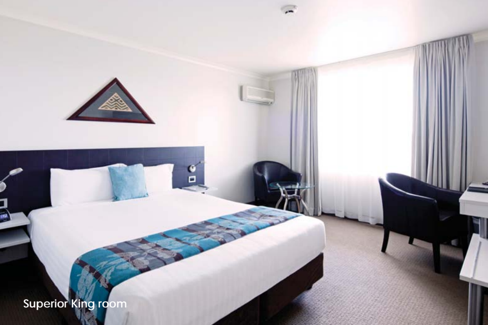
Superior King room