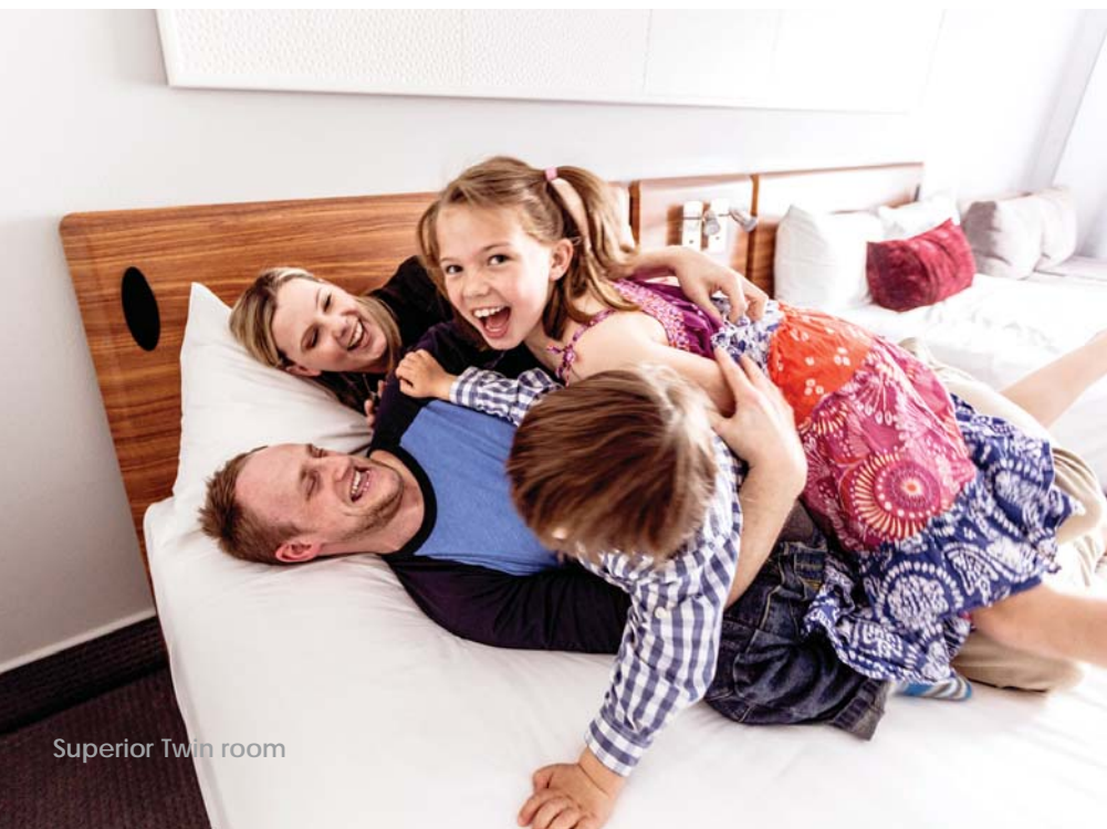
Superior Twin room