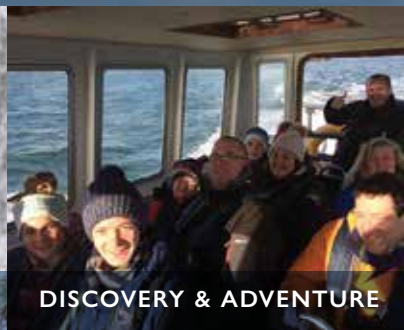
DISCOVERY & ADVENTURE

Guaranteed to raise a smile, Loch Tay Safaris brings the heritage and history of the water to life!