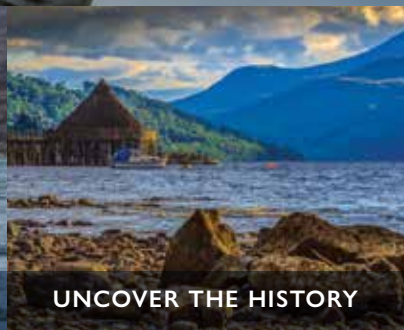
UNCOVER THE HISTORY