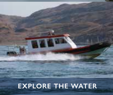
EXPLORE THE WATER

A Unique Experience to Discover an Awe-inspiring Place