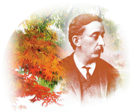
LAFCADIO HEARN Koizumi Yakumo

The Lafcadio Hearn Japanese Gardens reflect the life and extensive wanderings of Patrick Lafcadio Hearn, who grew up in Ireland, and whose life journey embraced several parts of the world. The gardens pay homage to the fame he attained in Japan through his incomparable literary descriptions of the people, customs and culture of that country.