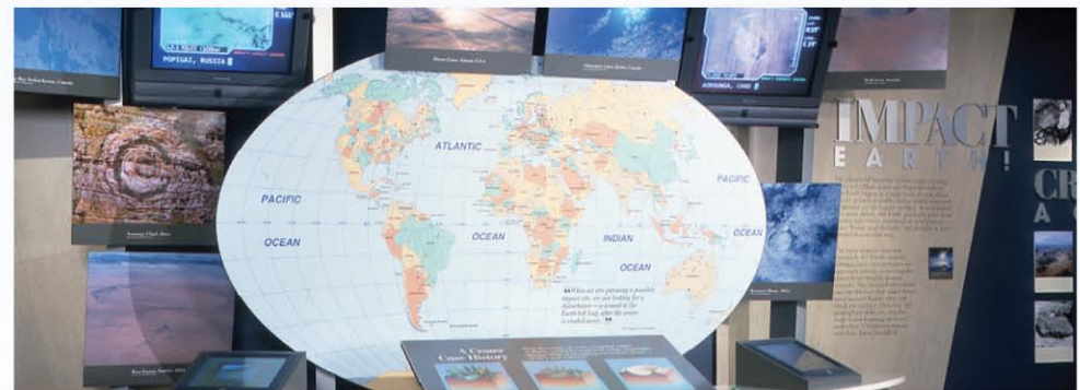
METEOR CRATER DISCOVERY CENTER WITH EXPLORATION ARTIFACTS & INTERACTIVE DISPLAYS.