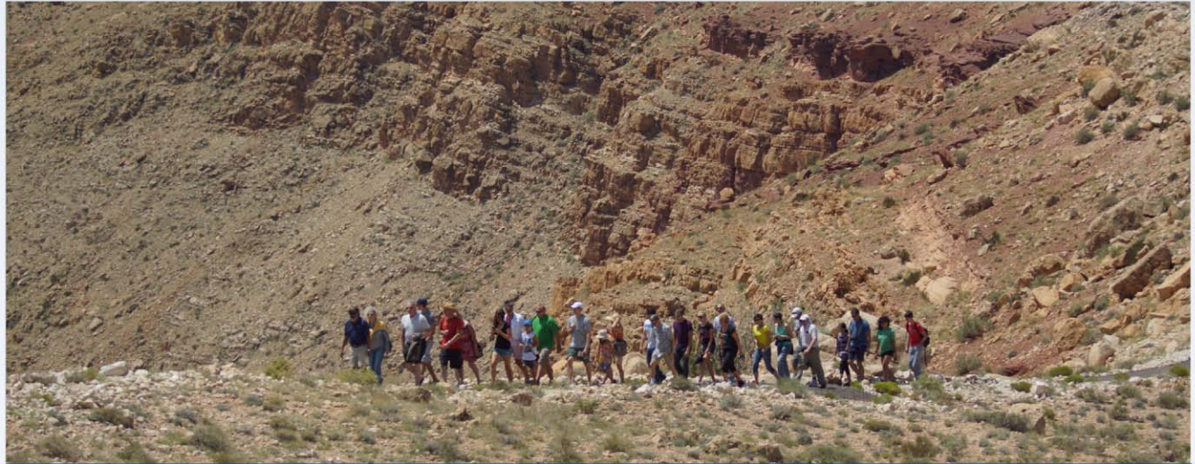
20 FOOTBALL FIELDS COULD BE PLACED ON THE CRATER FLOOR & MORE THAN 2 MILLION FANS COULD WATCH FROM THE CRATER WALLS!

Located in Northern Arizona, east of Flagstaff, the meteor's impact left a crater nearly a mile across and more than 550 feet deep, resulting in the excavation of a giant bowl-shaped cavity. A 60 story building could rest on its floor and just reach the crater rim. The topographical terrain of Meteor Crater so closely resembles that of the moon, NASA made it an official training site for the Apollo astronauts.