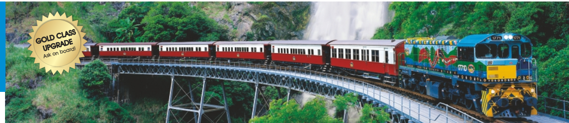
KURANDA SCENIC TRAIN