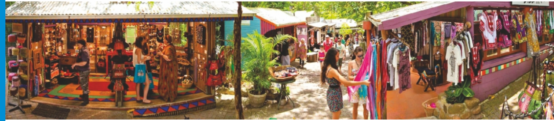
KURANDA VILLAGE AND MARKETS