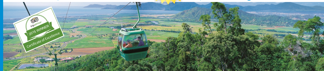
SKYRAIL RAINFOREST CABLEWAY

SCENIC TRAIN KURANDA SKYRAIL Specialising in service