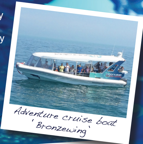
Adventure cruise boat 'Bronzewing'

Adults: $45 Child: $25 (3 to 16 years inclusive)