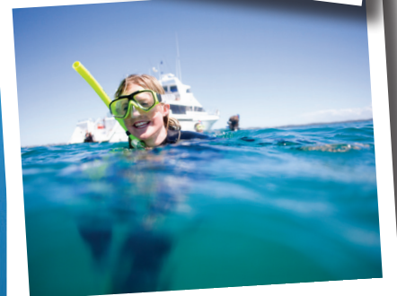
A day I will never forget!