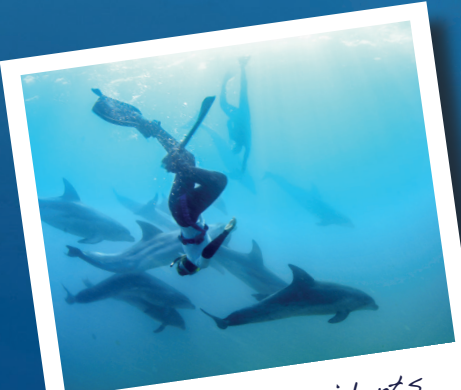
Meeting the residents