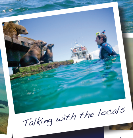
Talking with the locals