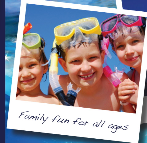
Family fun for all ages