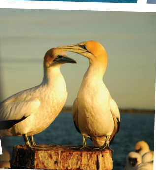
Nesting Gannet colony