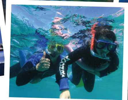
Experience of a lifetime