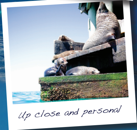
Up close and personal

Be prepared for an exciting magical experience. Meeting us at the Sorrento Pier, swimmers are provided with snorkeling equipment before stepping aboard the 'Moonraker' to experience an adventure packed 3hr-enchanted tour. Cruising out into the sheltered waters of Port Phillip Bay viewing the pristine coastline, cliff top mansions and famous beach boxes. Arriving at the Australian Fur Seals who are waiting to share their underwater world with you. Chinaman's Hat Seal Structure is a man made structure built just for the Seals! Offering shallow water snorkeling and beautiful white sand seabed, this area has a maximum depth of just 4mts.