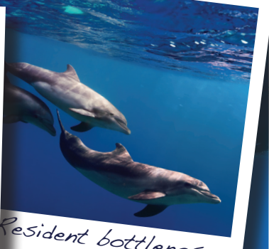
Resident bottlenose dolphins