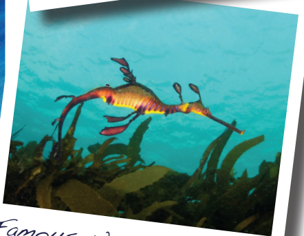
Famous Weedy Sea Dragon