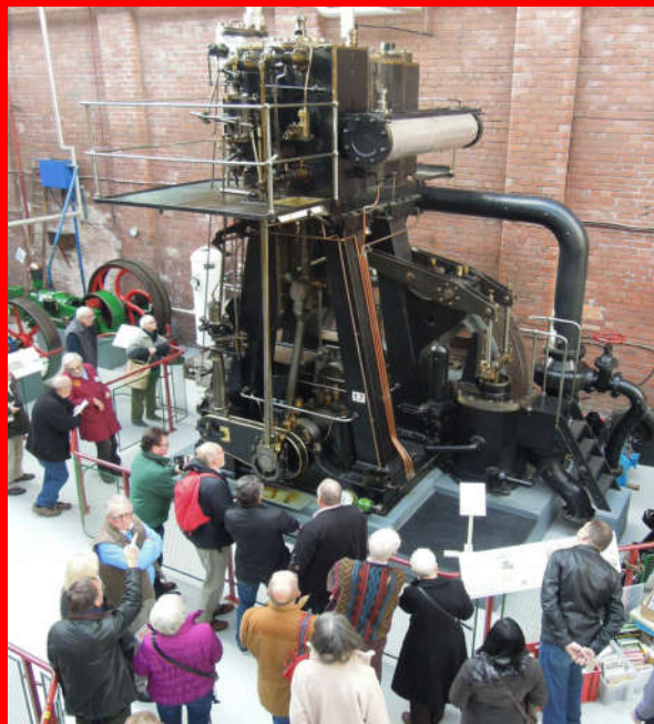
An inverted vertical engine from the "Diamond Ropeworks" at Royton, nr Oldham

There is free parking on the Supermarket car-park and a small shop and refreshment stall operate on steam days. Admission is free but donations are appreciated to help meet the cost of raising steam in the boiler. The museum is disabled-accessible with level floors, lift and toilets.