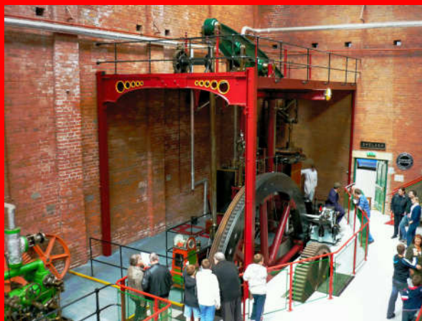
McNaught compound beam engine from a mill in Marsden, near Huddersfield

Our larger engines include a giant 40-ton "McNaughted" beam engine, a very rare 1840 twin-beam engine and a unique "non-dead-centre" vertical engine built by Musgraves of Bolton. A number of other engines are also on display, including a small engine "Caroline" that used to drive Fred Dibnah's workshop. All of them can be seen in motion on regular steam days.