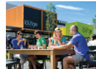
Re:Start Mall on Cashel Street