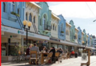
New Regent Street.