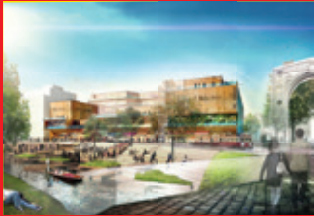
Artists impression of The Terrace development.