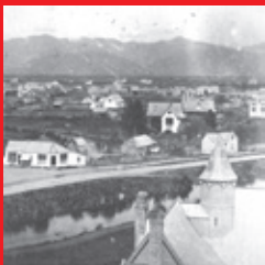
View South from the Provincial Council buildings 1860.

Tours include video footage and commentary from a Canterbury Museum guide who is available to answer questions.