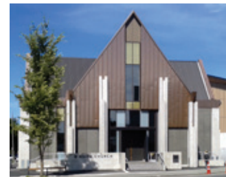
Knox Church