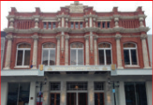
Isaac Theatre Royal