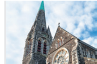
Christchurch Cathedral Pre-quake