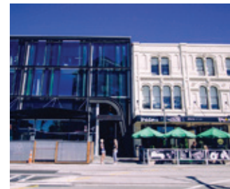
Outside Strange's Lane

21 Canterbury Provincial Government Buildings