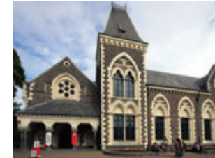
Canterbury Museum