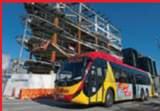
Rebuild tour coach