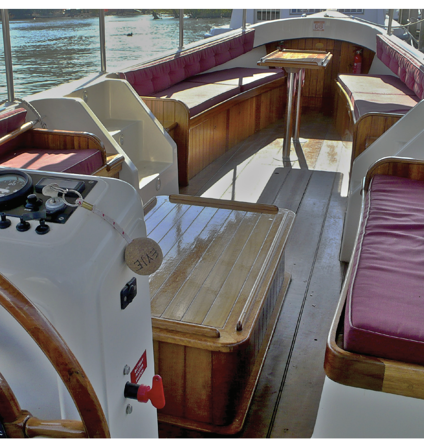
| Onboard a traditional Edwardian launch