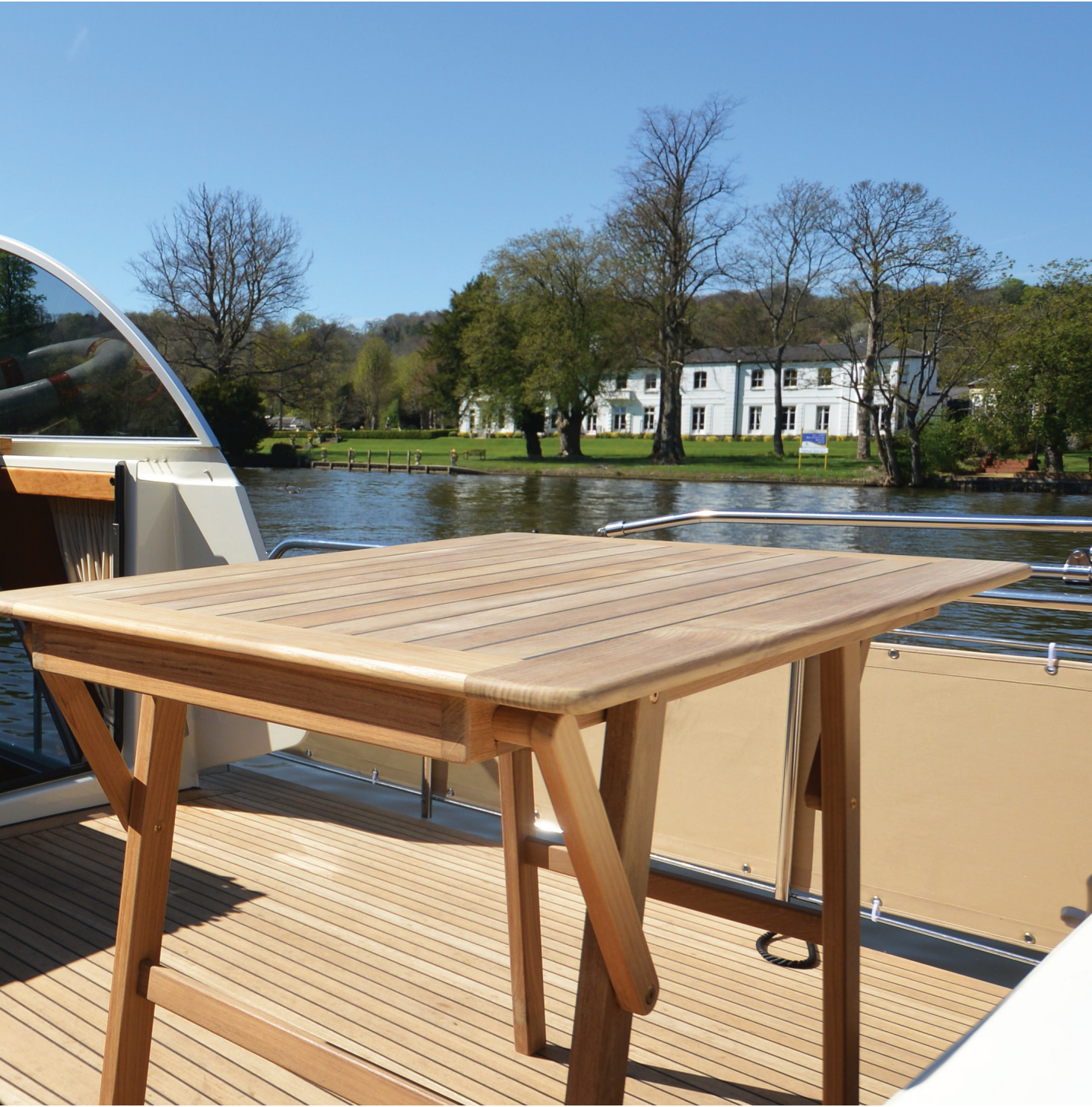
| Onboard the Linssen Class "Jacqueline IV"