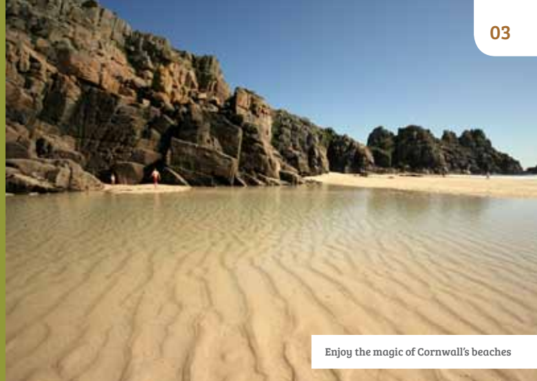
Enjoy the magic of Cornwall's beaches

We have everything you will need to make your stay the perfect Cornwall family holiday. For the kids there's a play area with trampoline, swings, slides and climbing frame as well as a games room with TV, table football and pool table. For those who like to stay in touch, there's also internet access with a free WiFi hot spot on site. If you run low on supplies we have a small shop/off-licence (once the blacksmith's forge) and also a payphone.