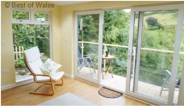
The view from the garden