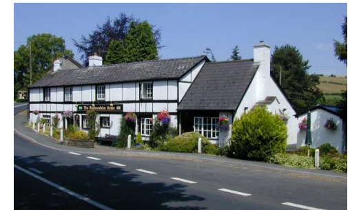
The Radnorshire Arms, Beguildy

Offa's Dyke, Glyndwr's Way and the Kerry Ridgeway are close by and the nights are truly dark and good for star gazing. The Brecon Beacons and the sea at Aberdovey and Aberystwyth are all within easy reach.