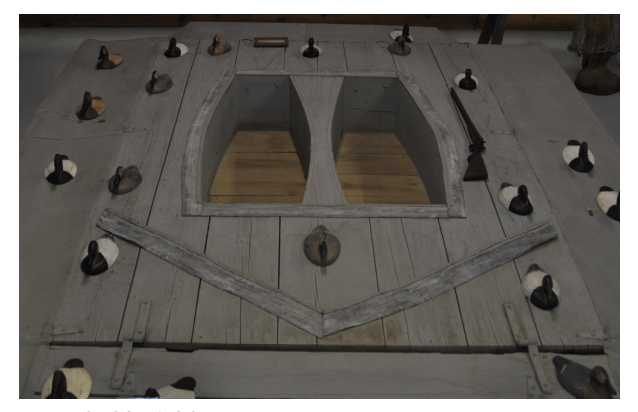
Rare double sinkbox

To preserve the lifestyle of the commercial waterman and hunter of the Upper Chesapeake Bay.