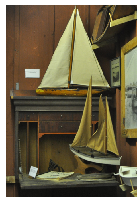
Wall desk, H. L. Harvey Fish Company