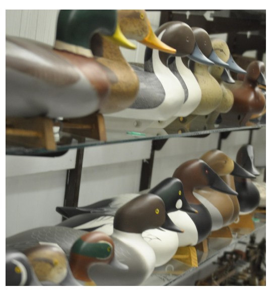
Just a few of the decoys on display

A dedicated group of members of the Cecil-Harford Hunters Association, founded in 1950, envisioned the museum in the early 1970s.