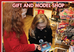
GIFT AND MODEL SHOP