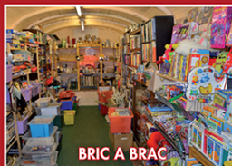
BRIC A BRAC