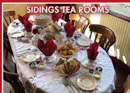
SIDINGS TEA ROOMS