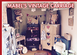
MABEL'S VINTAGE CARRIAGE