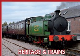
HERITAGE & TRAINS