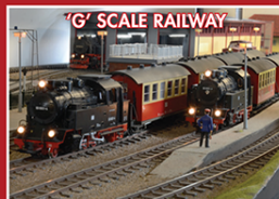
'G' SCALE RAILWAY