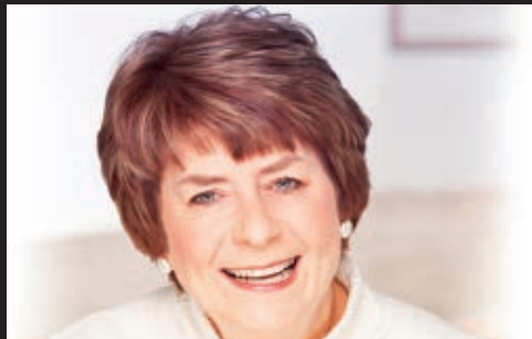
An Evening with Pam Ayres : 8 Oct