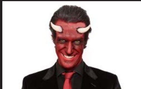
Marcus Brigstocke : Devil May Care : 16 Oct