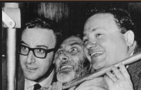
The Goon Show : 19 Sept

OUR PRICES: £6.50 STUDENT/CHILD £7.50 SENIOR (OVER 65) £8.50 ADULT