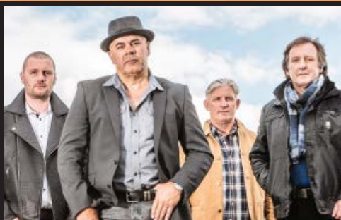
Talon : The acoustic Collection : 31 Aug