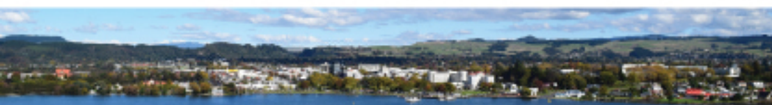
A relaxing scenic cruise that is uniquely Rotorua.

Departing daily from the Rotorua Lakefront and with two deck levels, outdoor viewing platforms, full bar service and informative commentary the Lakeland Queen offers a two in one experience with a dining and lake cruise to remember.