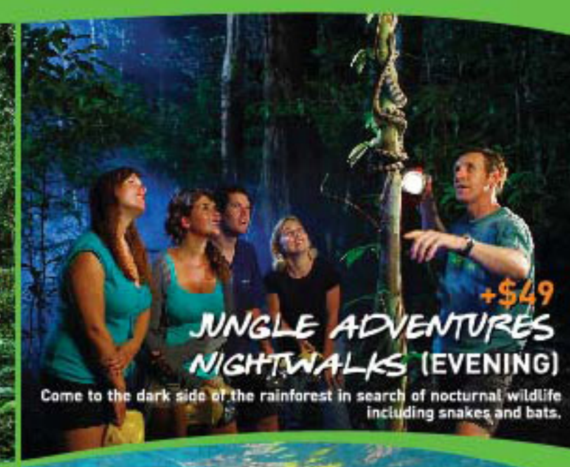
JUNGLE ADVENTURES NIGHTWALKS (EVENING) Come to the dark side of the rainforest in search of nocturnal wildlife including snakes and bats.