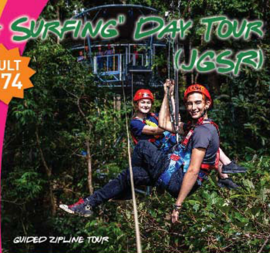
GUIDED ZIPLINE TOUR