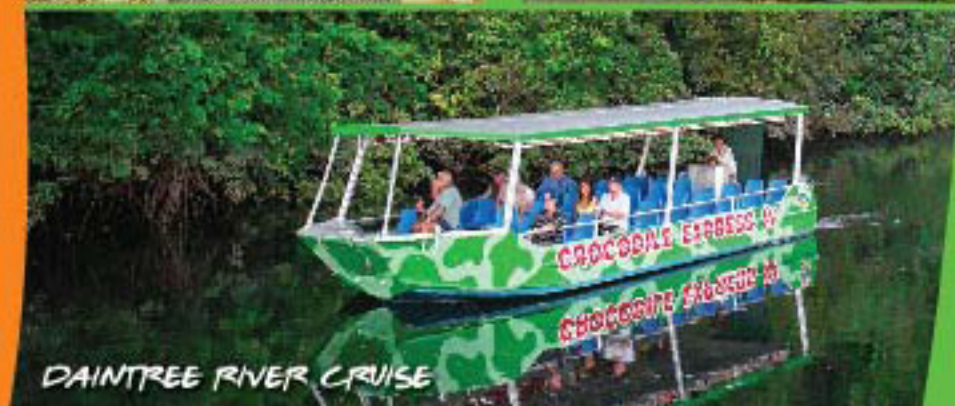
DAINTREE RIVER CRUISE