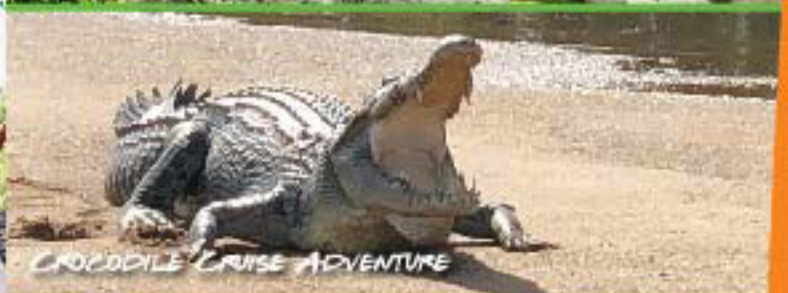
CROCODILE CRUISE ADVENTURE