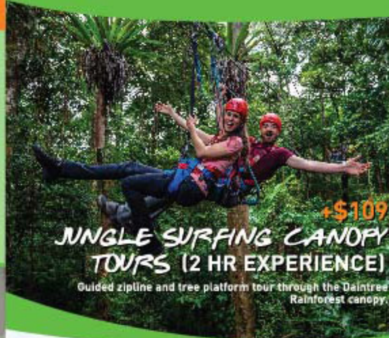
JUNGLE SURFING CANOPY TOURS (2 HR EXPERIENCE) Guided zipline and tree platform tour through the Daintree Rainforest canopy.

You will have plenty of free time on an overnight adventure, with a free afternoon on Day 1 and a free morning on your final day. If you stay for 2 nights, you'll also have a full free day on Day 2. Choose from the below optional activities, or simply take time out to relax. All meals at own expense, except where indicated.