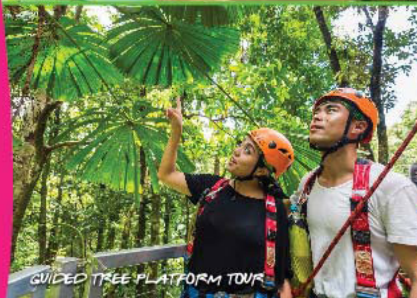
GUIDED TREE PLATFORM TOUR