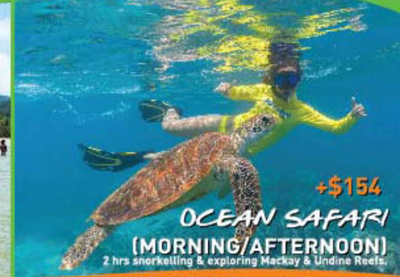
OCEAN SAFARI (MORNING/AFTERNOON) 2 hrs snorkelling & exploring Mackay & Undine Reefs.