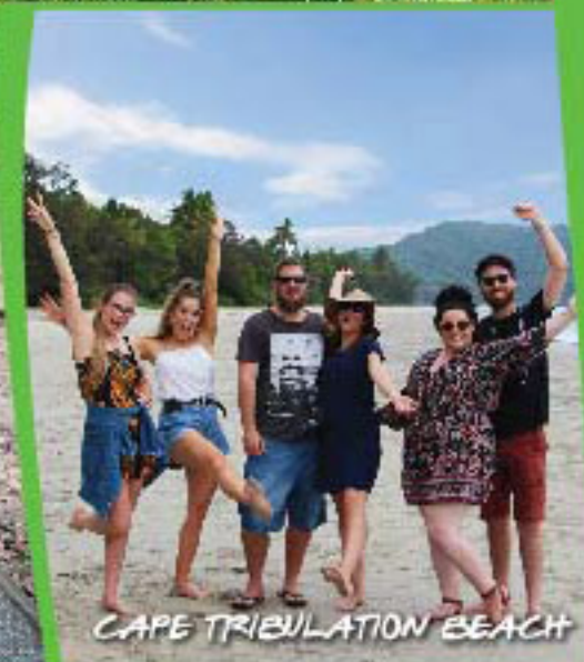
CAPE TRIBULATION BEACH