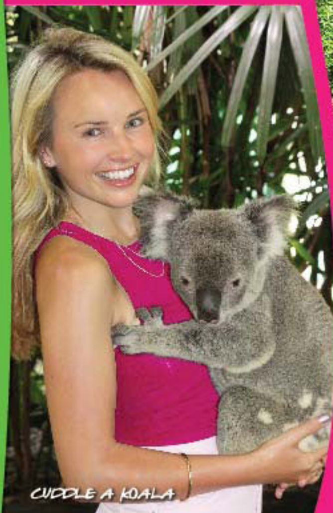
CUDDLE A KOALA