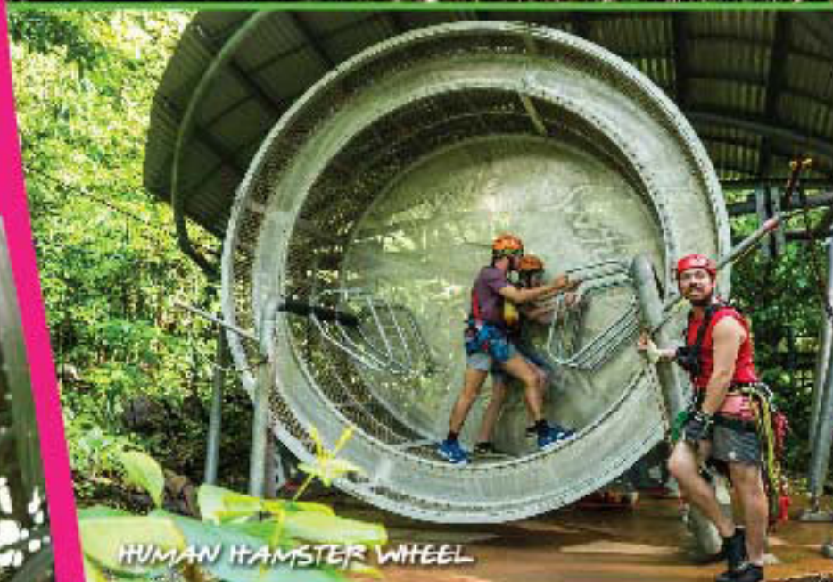
HUMAN HAMSTER WHEEL