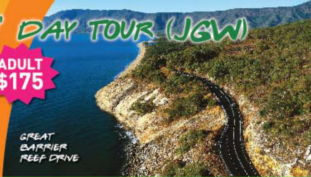
GREAT BARRIER REEF DRIVE