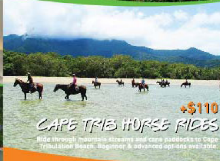
CAPE TRIB HORSE RIDES Ride through mountain streams and cane paddocks to Cape Tribulation Beach. Beginner & advanced options available.