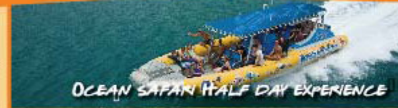
OCEAN SAFARI HALF DAY EXPERIENCE

All prices are per person. *Prices are per person and based on twin share. **Includes continental breakfast.