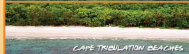
CAPE TRIBULATION BEACHES