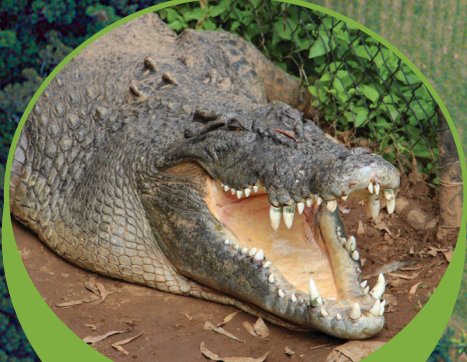
Jack the Ripper