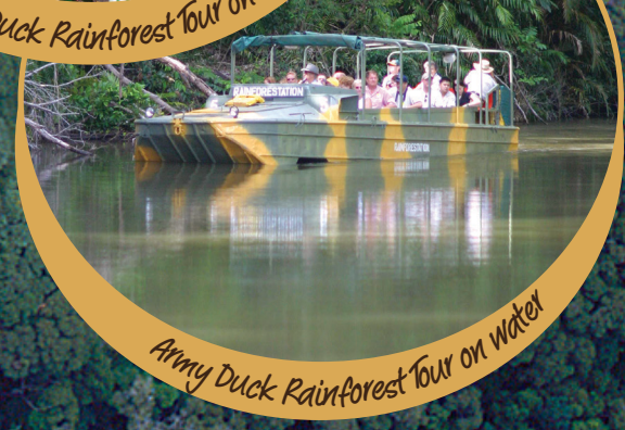
Army Duck Rainforest Tour on water