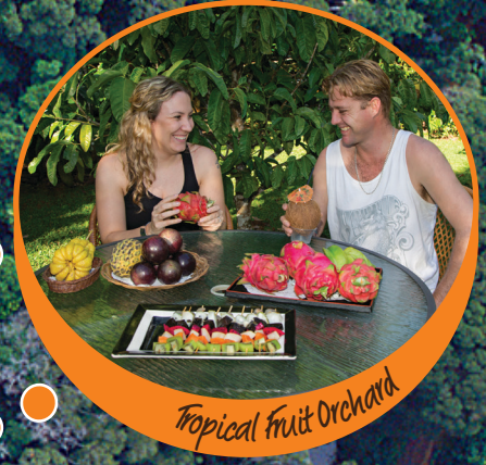
Tropical Fruit Orchard