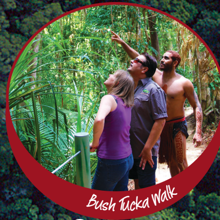
Bush Tucka Walk

Our restaurants can accommodate exclusive small or large functions, incorporating all of the park's attractions for a memorable event.