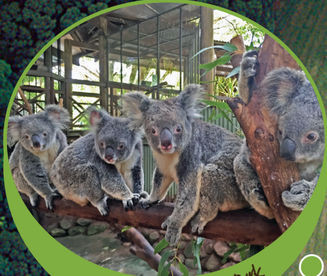
Koala and Wildlife Park

All times are approximate and subject to change.