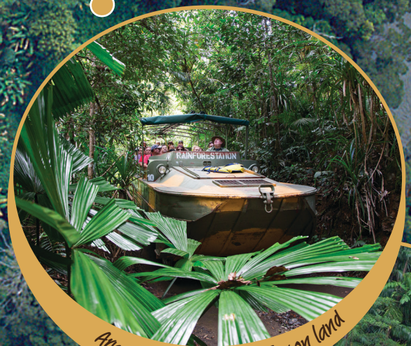
Army Duck Rainforest Tour on land