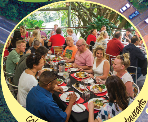
Colonial, Treehouse & Outback Restaurants