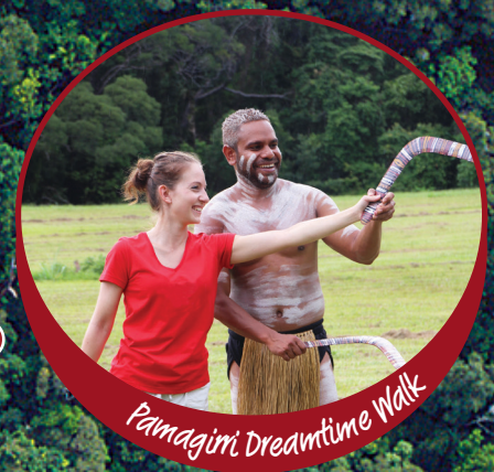
Pamagirri Dreamtime Walk