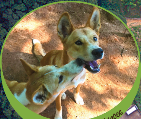
Ned and Kelly the Dingoes