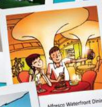
Alfresco Waterfront Dining