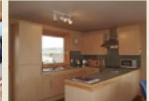
Fully appointed kitchen with all the mod cons