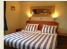
Comfortable super king size bed