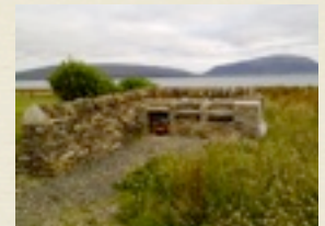
Enjoy tasty barbeques with one of the most beautiful of views