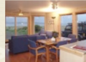
Views of Scapa Flow from spacious dining room and lounge