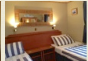
King size bed can be split into twin beds