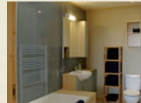
Roomy modern bathroom with shower over tub