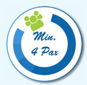
Minimum 4 Pax