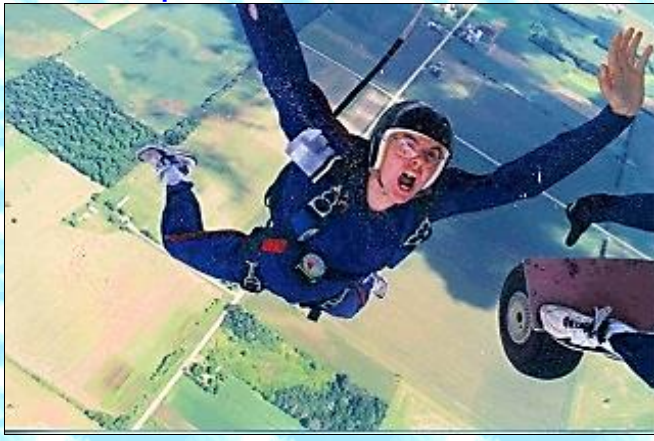
Above anything else you'll ever do!

(608) 244-5252 www.sevenhillsskydivers.org