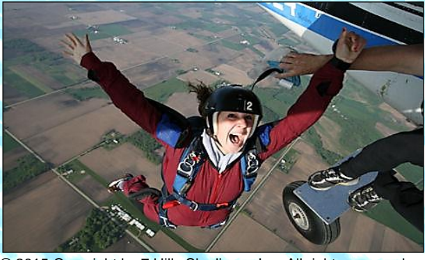
© 2015-Copyright by 7 Hills Skydivers, Inc. All rights reserved.

E-mail: mail@sevenhillsskydivers.org Web: www.sevenhillsskydivers.org