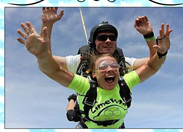
Learn to Skydive!