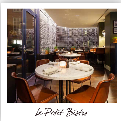
Le Petit Bistro