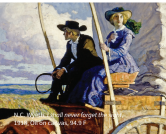
N.C. Wyeth, I shall never forget the sight , 1918, Oil on canvas, 94.9 F