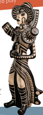
Virgil Ortiz, Ancient Elder Figure, 2012, Ceramic, 2014.6.1