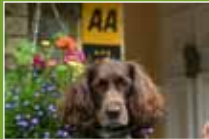
Resident dog Mocca

The hotel is set in close to three acres of Devon countryside mostly laid to lawn but with many secluded spots, ideal to get away from it all. The gardens boost a selection of unusual trees and shrubs from around the world.