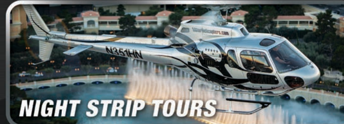
NIGHT STRIP TOURS