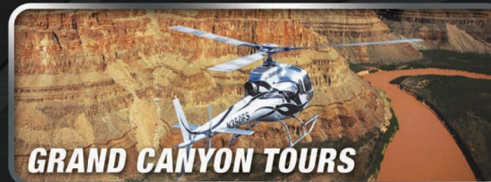
GRAND CANYON TOURS