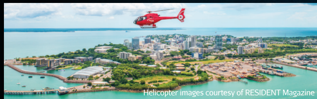
Helicopter images courtesy of RESIDENT Magazine

Inclusions: As per 10 min scenic plus Northern Beaches, Gunn Point, The Vernon Islands. *Additional charges may apply.