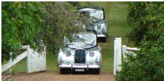
A bridal party arrives at Saumarez Homestead

Web: www.nationaltrust.org.au/nsw/saumarezhomestead