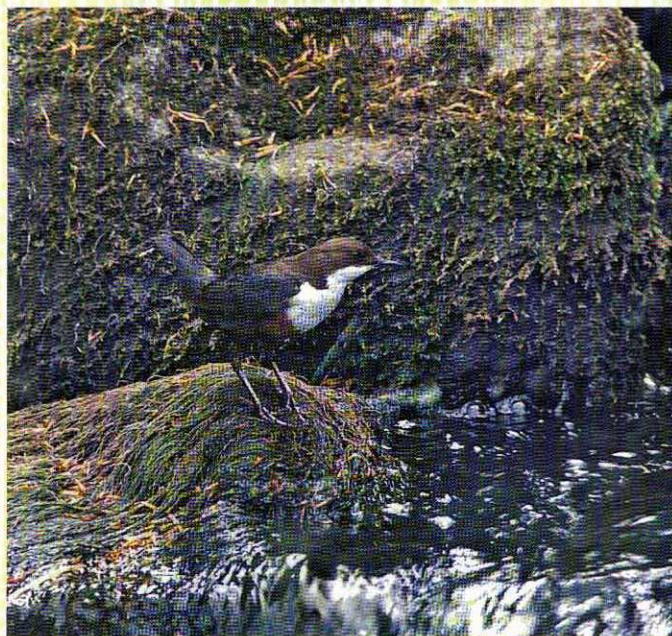
ONE OF THE RESIDENT DIPPERS

Attractions The area provides the holidaymaker with a wealth of attractions, including the festival town of Ludlow, famous for its festival and Michelin starred restaurants, the beautiful medieval town of Shrewsbury and the historic town of Ironbridge with its famous bridge and the fascinating Ironbridge Gorge museums.