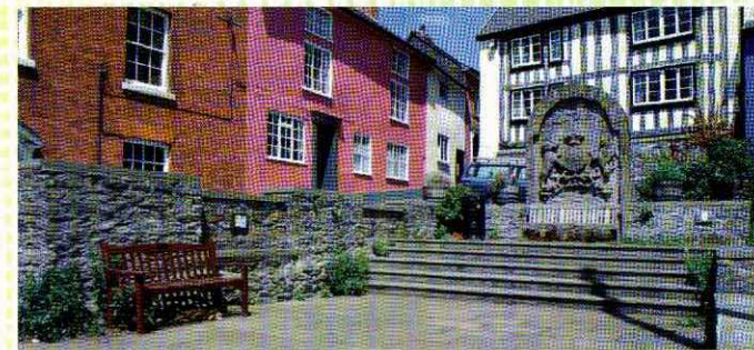
THE SQUARE, BISHOP'S CASTLE

Also within easy reach are castles, working museums of industry and agriculture, many superb walks, including the rugged beauty of the Stiperstones, the Long Mynd with its breathtaking views and even a step back in time along Offa's Dyke path.