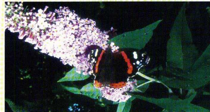
RED ADMIRAL FEEDING ON BUDDLEIA

There are also badger sets and many different varieties of wild flowers. The park has been accredited with a David Bellamy Gold Conservation award since 2000.