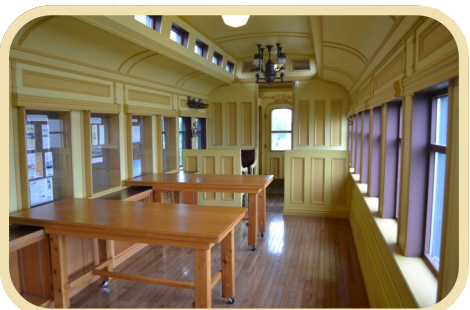
Restored baggage car for workshops.