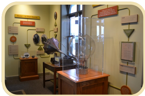
Displays and processes of his inventions.