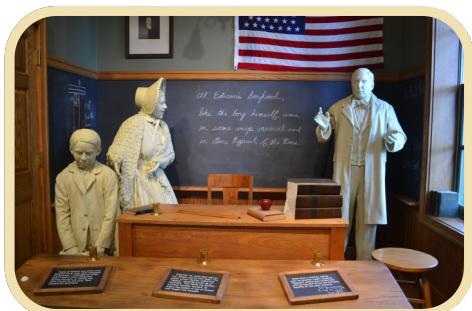
Diorama with audio of Edison's early life.