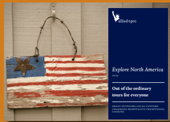
Explore North America