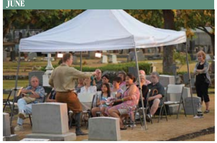
Cemetery Pupu Theatre takes place in historic Oahu Cemetery

CEMETERY PUPU THEATRE—NEW PRODUCTION PREMIERE