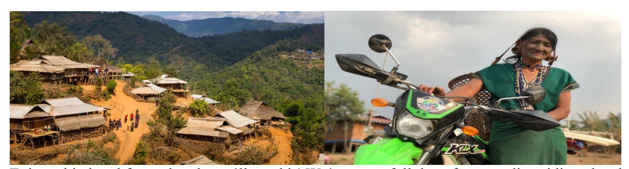
Day 2: Pakokku - Pauk - Mindat & Mindat sightseeing (160 km) (B/L/D)

Enjoy a big breakfast at hotel, you'll need it! We've got a full day of outstanding riding ahead of us today! Expect a good mix of road/gravel and single trails as we ride some excellent terrain. It is a journey to vanishing face of Burma - Mindat. Located in the western part of Myanmar, Mindat is accessible by road from Bagan, one of the most famous ecotourism sites in Myanmar. A visit to Chin region is an opportunities to observe their strange traditional custom and chin women with tattoos on their faces.