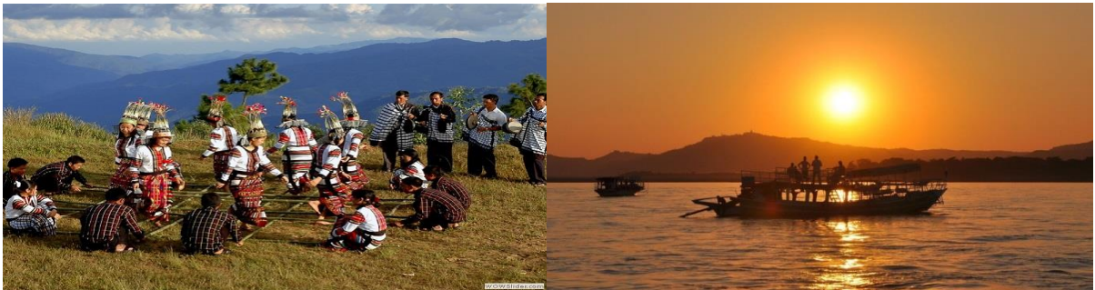
Day 4: Kanpetlet - Seik Phyu - Chauk - Bagan (180 km) (B/L/D)

Another awesome full day of riding (one of the best days on the calendar!) when you are heading into Bagan - the visual wonder of the world alongside with Angkor in Cambodia and