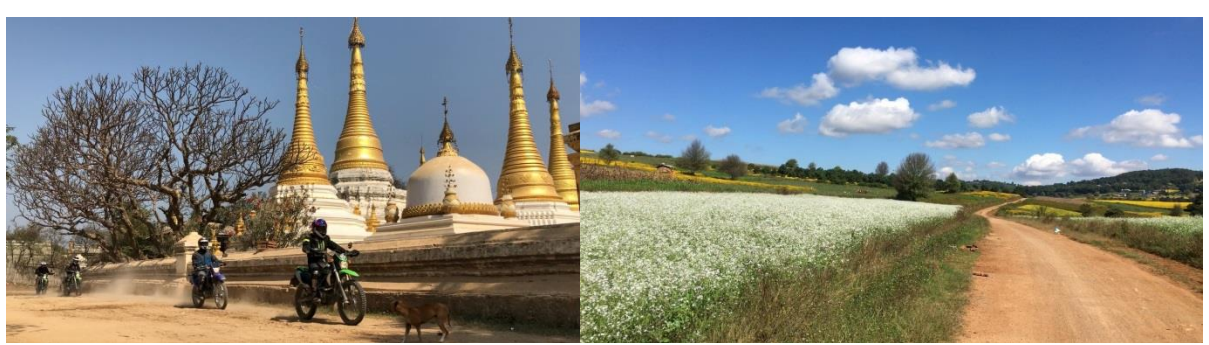
Day 7: Kalaw - Look Pyin - Nan Thale Thee - Kyauk Su- Inle (135 km) (B/L/D)

Another fantastic day goes ahead with Shan Mountains trails and experience incredible scenery, friendly locals and many waving children always excited to see. We'll pass through some small villages these are less visited by foreigners and stop at the village and spend your time to interact with local people to have the great fun. Enjoy the picnic lunch at the village on the way to Inle Lake. Upon arrival in Nyaung Shwe, you will check in hotel then be free to discover the town on your own.