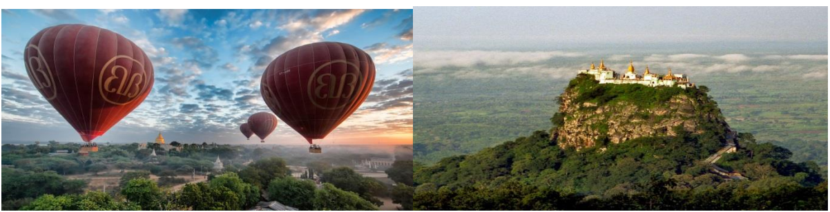
Day 5: Bagan sightseeing by car & Bagan - Popa by motorbike (60 km) (B/L/D)

This morning we are going to explore the highlight of Bagan by car. After breakfast at hotel, we will be devoted to discover of Bagan - the mystic extraordinary archaeological site with its 3000 temples. Start a sightseeing tour with a visit to Nyaung Oo Colorful Market and a diverse selection of the most important pagodas and temples such as Shwezigon Pagoa, a prototype of later Myanmar stupas, built by King Anawrahta in the early 11th century, Wetkyi Inn Gubyaukgyi, fine mural paintings of Jataka scenes; and Htilominlo Pagoda, noted for its plaster curving, Ananda Temple, the best preserved masterpieces of Mon architecture and the Tharaba gate.