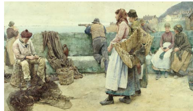
Walter Langley Departure of the Fleet for the North

Our well-stocked shop offers a wide range of prints, books, gifts and souvenirs. A mail-order service is available.