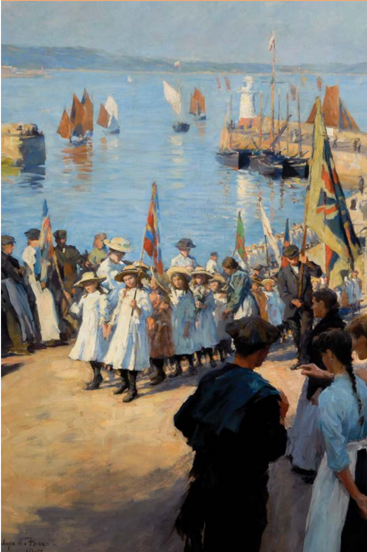
Detail: Gala Day at Newlyn, 1907 Stanhope Forbes Hartlepool Culture and Information Service

THE ARTISTIC HEART OF WEST CORNWALL'S HISTORY