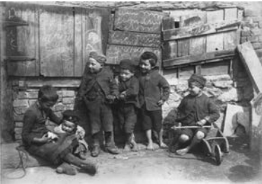
Cornish Urchins, circa 1880