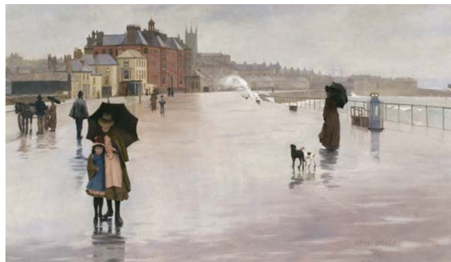
Norman Garstin The Rain it Raineth Every Day