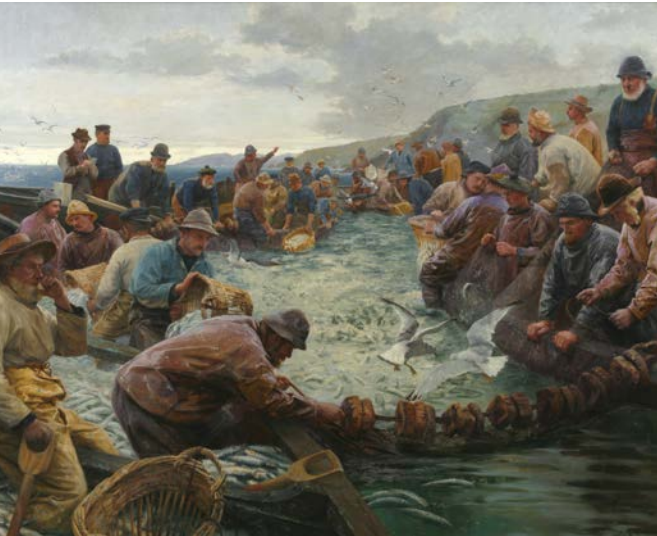
Tucking a School of Pilchards, 1897 Percy Craft Penlee House Gallery & Museum

The Newlyn School artists ‘discovered’ this picturesque fishing village at a transitional moment in its history. Just as the painters were setting up their easels and depicting the lives of the local Newlyn community in the 1880s, its fishing industry was expanding rapidly. By 1900, both the north and south piers had been built, fish sales had moved from the beach to purpose-built sheds and Newlyn fishermen had fought pitched battles with their Lowestoft rivals in the infamous Newlyn Riots of 1896. A few years later, in 1908, the new harbour road cut Gwavas Quay off from the sea. Featuring a wealth of paintings, photographs and artefacts from the period 1880 to 1930, this exhibition provides an insight into how the artists represented these changes, or chose to ignore them for the sake of artistic license. Curated with assistance from Dr Joanna Mattingly.