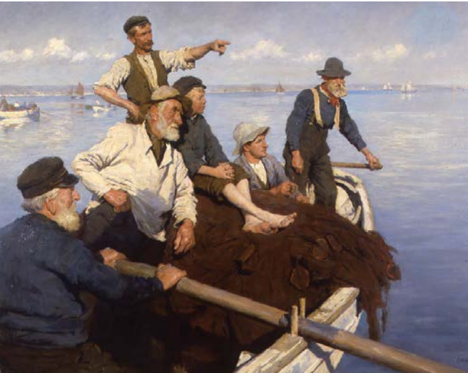
The Seine Boat, 1903-4 Stanhope Forbes Private Collection

Stanhope Forbes (1857 – 1947) was one of the ‘greats’ of the Newlyn School artists’ colony which flourished from the 1880s onwards. Although by no means the first artist to set up in Newlyn, Forbes’s arrival galvanised the emerging art community and helped to build its national and international reputation. For this reason, he is often dubbed the ‘Father of the Newlyn School’, which reflects both his significance and his popularity. Born in Dublin, Forbes trained at the Royal Academy Schools in London and finished his studies at Bonnat’s studio in Paris. After arriving in Newlyn in 1884, his national reputation was established a year later with the acceptance of his masterpiece, Fish Sale on a Cornish Beach at the Royal Academy. Comprising a stunning selection of key works from all periods of Forbes’s career, this exhibition celebrates his consummate skill as an artist. Throughout the Galleries.