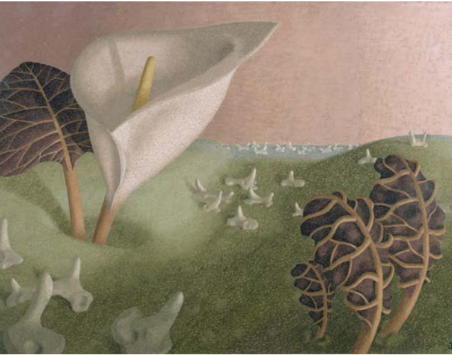
Lily in Landscape, 1942 John Armstrong

Ground floor galleries. A selection of Newlyn School paintings on view upstairs in Gallery 5.