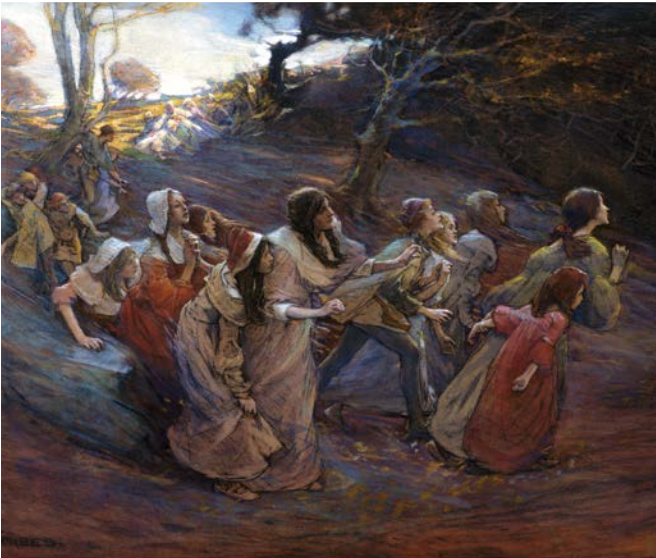
Detail: The Pied Piper Elizabeth Adela Forbes Penlee House Gallery & Museum, Penzance

Since undergoing major refurbishment in 1997, Penlee House Gallery & Museum has become one of the nation’s leading regional museums. It is internationally renowned for its important collections of 19th and 20th century British art, in particular paintings by artists of the Newlyn School. This exhibition shows how Penlee’s marvellous collections have developed over two decades, through fine and decorative art, social history, photography and archaeology. Throughout the Galleries.