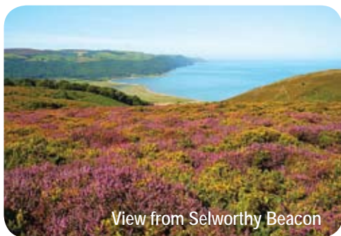
View from Selworthy Beacon