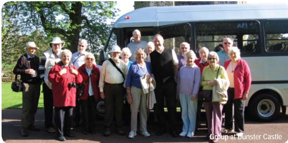
Group at Dunster Castle

Are you a member of a group who would like to come on one of our activity breaks? For groups of 10 or more, we can offer a discount on the prices shown of up to 10%. If any of the dates for an activity are not suitable for your group, please contact us. Alternative dates may be available.