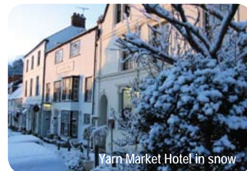
Yarn Market Hotel in snow