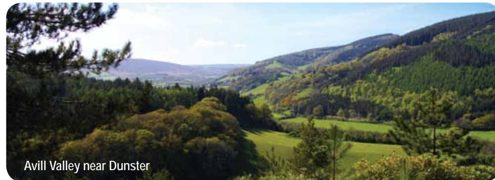
Avill Valley near Dunster

For those coming by car we can provide free car park passes for Dunster car parks, although the High Street does have free car parking when available.