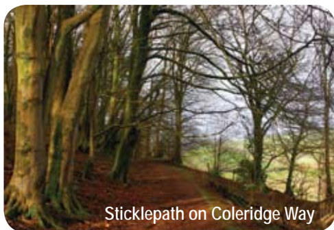
Sticklepath on Coleridge Way