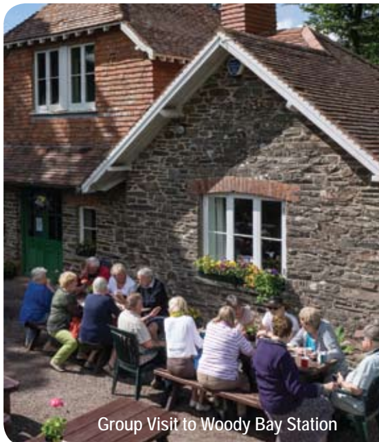
Group Visit to Woody Bay Station

Yarn Market Hotel High Street, Dunster Exmoor TA24 6SF