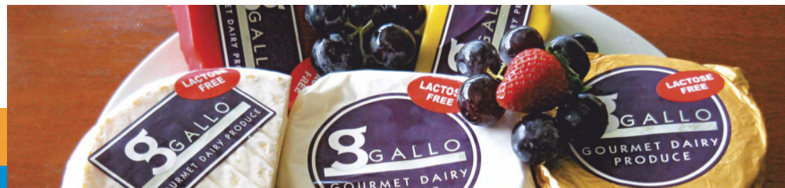
CHEESE, COFFEE & CHOCOLATE