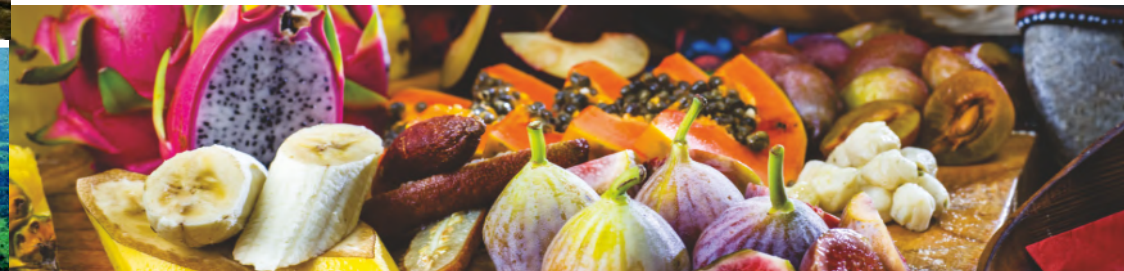
EXOTIC TROPICAL FRUITS