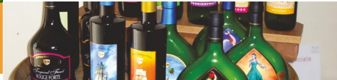
TROPICAL FRUIT WINES & LIQUEURS