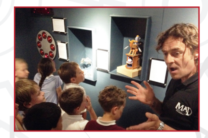
Group & School Visits

Engaging. Inspiring. Educational. Educational trips, interest groups, touring groups and corporate events — we offer a broad assortment of discounted packages for all kinds of groups. Please check the website for more details.