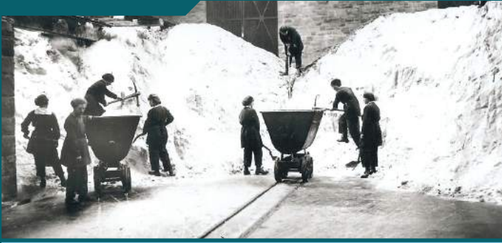
The munitions girls transformed enormous piles of white, crystalline nitre into nitric acid - a core ingredient in the manufacture of cordite.