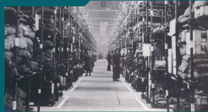
Female Workers inside COD Longtown Munitions Depot in 1944.

During World War Two the Solway region was transformed again to serve the war effort. Local women produced cordite at Powfoot's ICI Munitions Factory and handled munitions at the depots of Eastriggs and Longtown. The Women's Land Army worked on local farms with the help of Italian and German Prisoners of War . Fighter aircraft filled the sky as RAF pilots from across the Commonwealth trained for the D-Day invasion of occupied Europe in 1944 . Convoys of British and American soldiers travelled through Eastriggs and Gretna, much to the delight of local children.