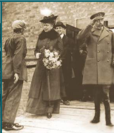
King George V and Queen Mary visited the factory in 1917 in recognition of the workers' remarkable achievements.