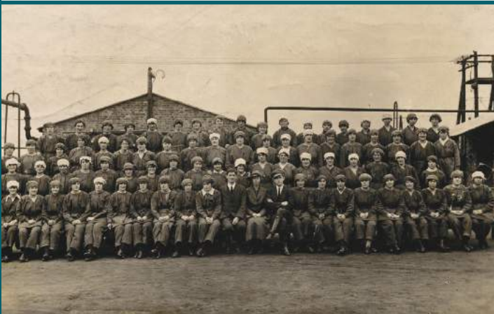
In 1916, 60% of the factory's workforce was aged under 19. For many young girls, HM Factory Gretna was the ultimate war-time experience.

The “ garden cities ” of Gretna and Eastriggs were carefully designed and built to house the 30,000 munitions workers . These new townships offered modern housing, shops, schools, churches and cinemas to meet all the social needs of the workforce.