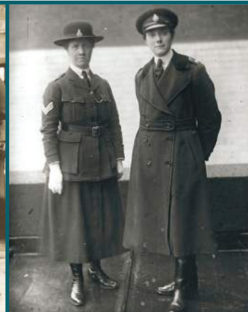
The factory offered new opportunities for women, including the chance to join the Women's Police Force.