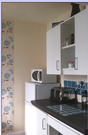
Kitchenette, Twin/Double Room & Balcony