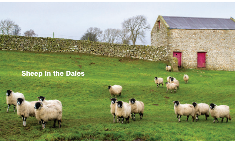
Sheep in the Dales