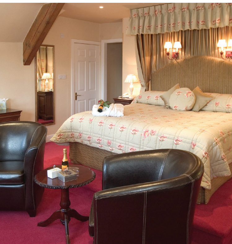
An example of a 4* bedroom

Our sister company Mountain Goat based in the Lake District offers a range of short break packages to suit all tastes. The breaks include transfers from Windermere Rail Station, one or more full day tour and accommodation in either Windermere or Bowness-on-Windermere. You have the choice of a Traditional Lakeland Guest House or stay in one of the Lake District's finest 4* hotels, The Lindeth Howe County House Hotel, with fine 2 AA Rosette Dining.