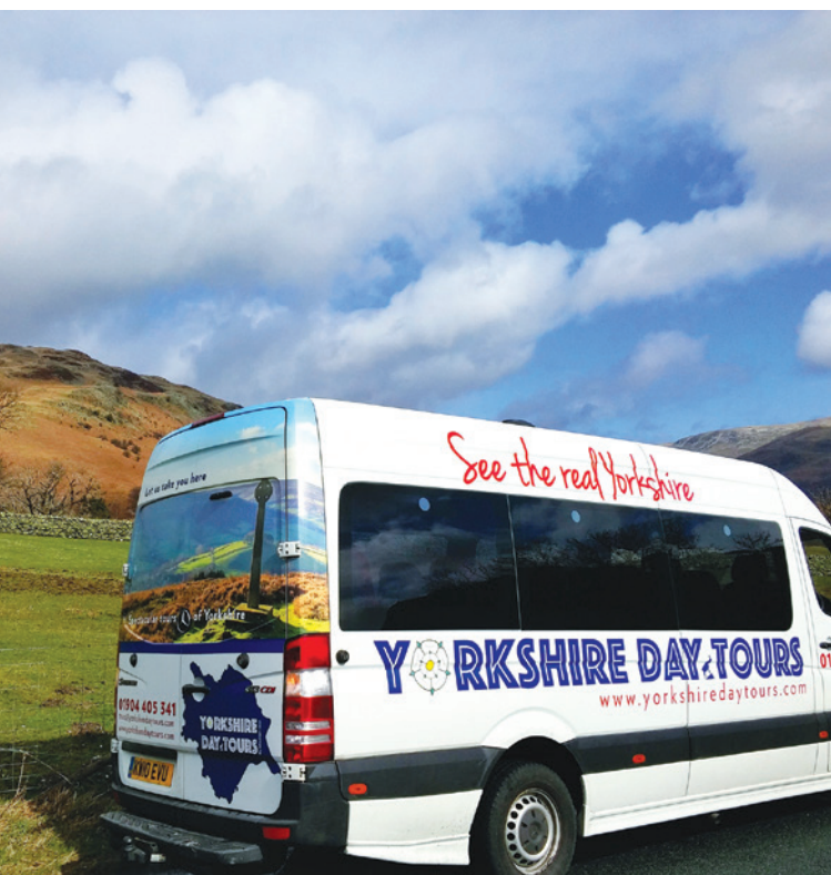
One of our Mini-Coaches