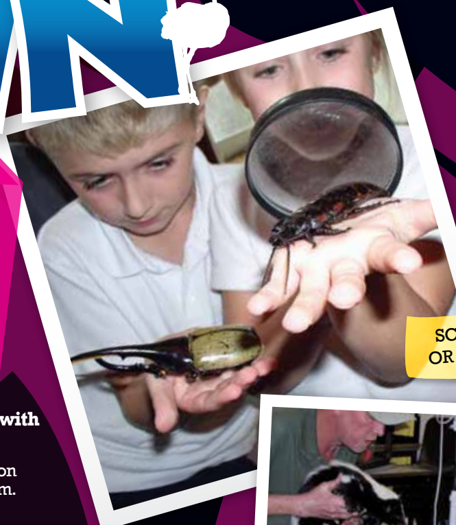
SCHOOLS OR GROUPS