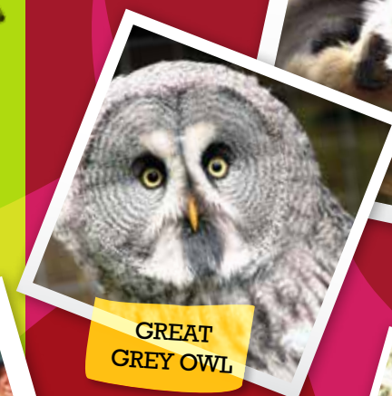
GREAT GREY OWL

"How nice to see a zoo that really cares. It'd be a real shame if they were to die out altogether." K Green